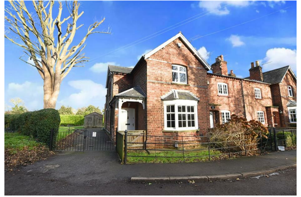
PHOTO TAKEN BY THE VENDOR DURING THE SUMMER

PLEASE NOTE THESE ARE DRAFT PARTICULARS AWAITING FINAL APPROVAL FROM THE VENDOR, THEREFORE THE CONTENTS HEREIN MAY BE SUBJECT TO CHANGE AND MUST NOT BE RELIED UPON AS AN ENTIRELY ACCURATE DESCRIPTION OF THE PROPERTY.